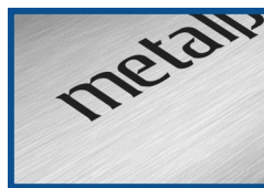
# 4 brushed to resemble a stainless steel finish